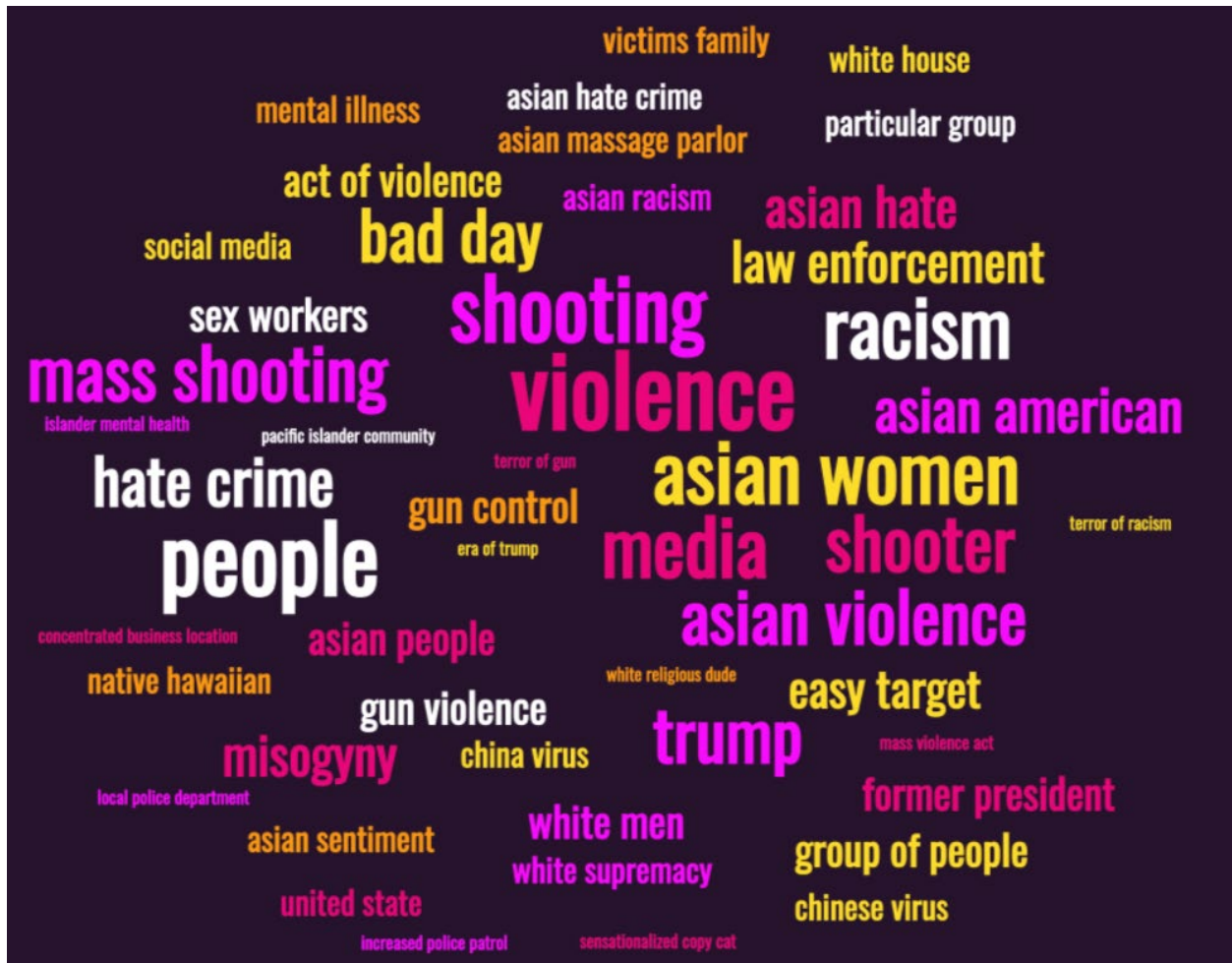
Quotes - Word Cloud