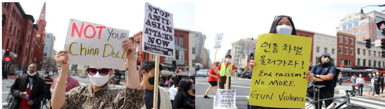
Stop Asian Hate.